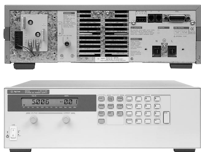
6671A - 6675A