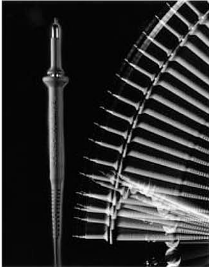
B-Series Family Photo.