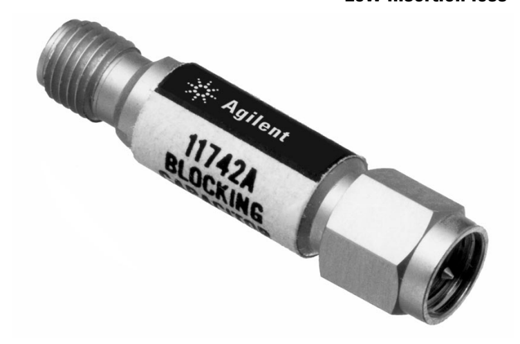
0.045 to 26.5 GHz Low insertion loss

The Agilent Technologies 11742A offers a new level of performance in coaxial blocking capacitors. Featuring a frequency range of 0.045 to 26.5 GHz with low SWR (< 1.11 to 12.4 GHz and <1.23 to 26.5 GHz) and low insertion loss, the 11742A is ideal for use with high frequency oscilloscopes.