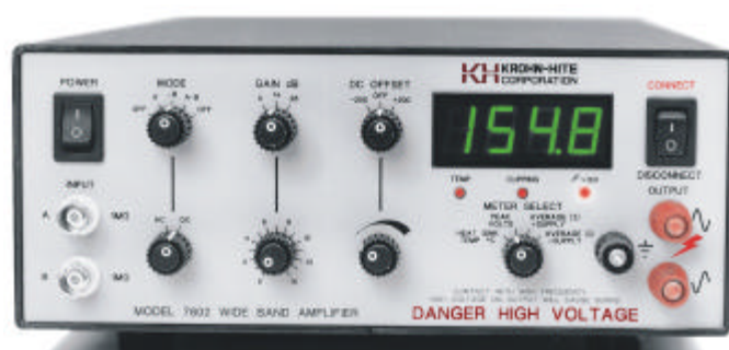
Figure 2.2 Model 7602M with Meter Option Package