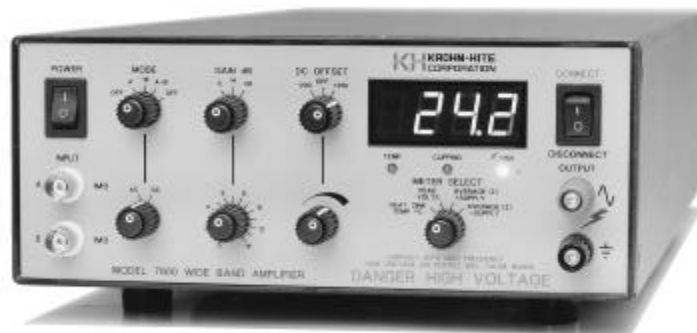
Figure 2.1 Model 7600M with Meter Option Package