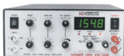
Model 7602M ("M" is the Meter Option Package)