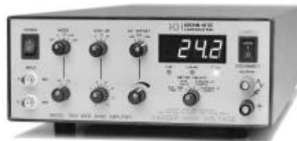
Model 7600M ("M" is the Meter Option Package)