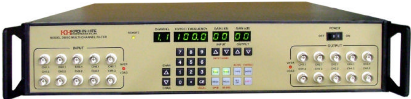
Figure 2.1 Model 3905C Front Panel Controls

Figure 2.1 shows all the front panel controls and displays of the Model 3905C.