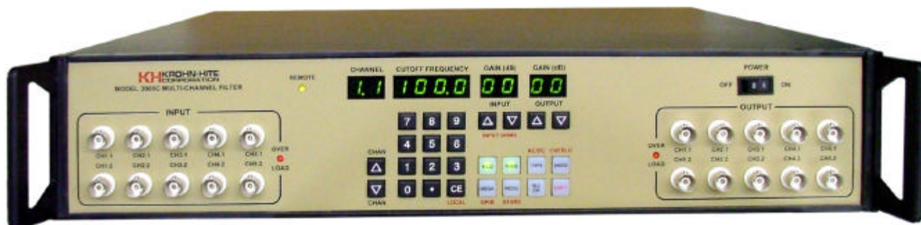
Model 3905C IEEE-488 Programmable Filter Mainframe