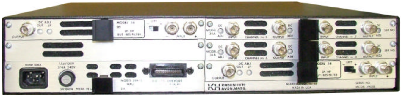
Figure 2.2 Rear Panel of Model 3905C