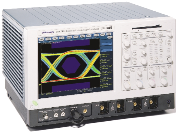
► The CSA7404 Communications Signal Analyzer performs mask testing and signal analysis for optical and electrical communications signals at rates up to OC-48 /STM-16; 2.5 Gbps.