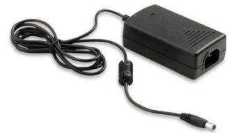
U1780A Power adapter and cord (according to country)