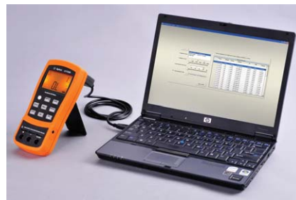
Figure 1: Automate the recording of continuous readings when you hook the U1701A/U1701B to a PC

The handheld capacitance meter comes in a robust overmold and tested to stringent industrial standards. Each capacitance meter is also sealed with a three-year warranty and the assurance that you can test your components with confidence.