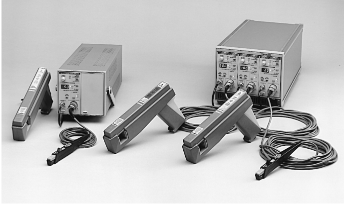
AM503 Current Measurement Family