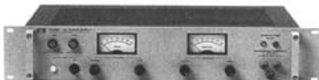
HP 6263B, 6266B