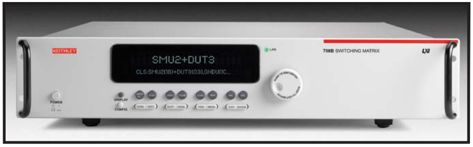
Model 708B Single-slot Semiconductor Switch Matrix Mainframe

High performance Model 707B and 708B semiconductor switch matrix mainframes slash the time from command to connection, offering significantly faster test sequences and overall system throughput than Keithley's earlier 707A and 708A mainframes.