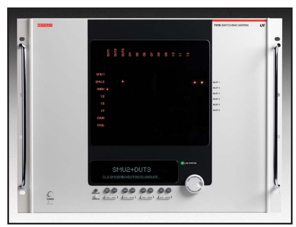
Model 707B Six-slot Semiconductor Switch Matrix Mainframe

The six-slot Model 707B and single-slot Model 708B Semiconductor Switch Matrix Mainframes extend Keithley's decades-long commitment to innovation in switch systems optimized for semiconductor test applications. These mainframes build upon the strengths of their popular predecessors, the Models 707/707A and 708/708A, adding new features and capabilities designed to speed and simplify system integration and test development. New control options and interfaces offer system builders even greater flexibility when configuring high performance switching systems for use in both lab and production environments. Just as important, both new mainframes are compatible with the popular switch cards developed for the Models 707A and 708A, simplifying and minimizing the cost of switch system migration.