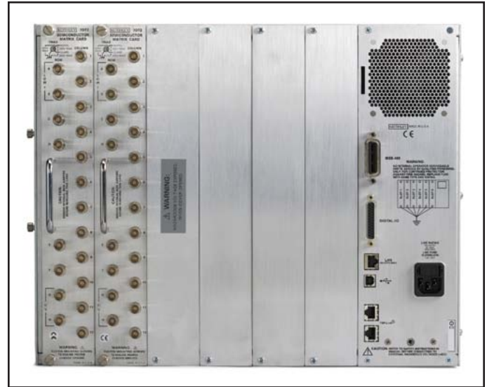
Model 707B rear panel