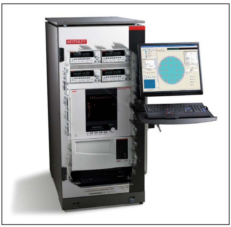
The 707B or 708B can be easily used as a drop-in replacement for the 707A or 708A in a test system based on the Model 4200-SCS semiconductor parameter analyzer.

Both mainframes offer a variety of manual operation and remote programming functions via either the front panel controls or a choice of interfaces. For example, for manual operation, such as when