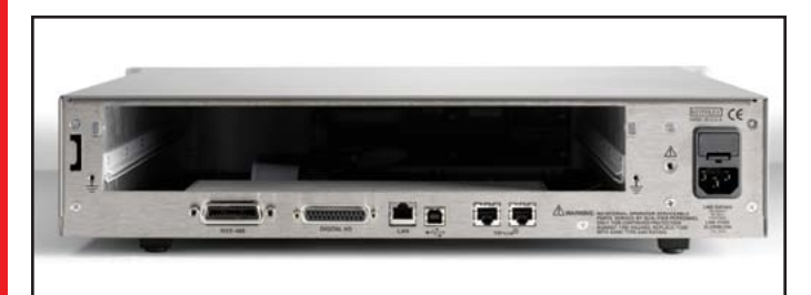
Model 708B rear panel

In common with Series 2600A instruments, the Models 707B/708B provide system builders with the advantages of the Keithley Test Script Builder (TSB) Integrated Development Environment (IDE). TSB IDE is a programming tool provided on the CD that accompanies each mainframe. It can be used to create, modify, debug, and store TSP scripts. It provides a project/file manager window to store and organize test scripts, a text-sensitive program editor (like Visual Basic) to create and modify test TSP code, and an immediate instrument control window to send GPIB commands and receive data from the instrument. The immediate window allows viewing the output of a given test script and simplifies debugging.