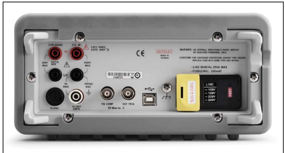
Model 2100 rear panel

AC CMRR: 70dB (for 1kΩ unbalance LO lead). POWER SUPPLY: 120V/220V/240V. POWER LINE FREQUENCY: 50/60Hz auto detected. POWER CONSUMPTION: 25VA max. DIGITAL I/O INTERFACE: USB-compatible Type B connection. ENVIRONMENT: For indoor use only. OPERATING TEMPERATURE: 5° to 40°C. OPERATING HUMIDITY: Maximum relative humidity 80% for temperature up to 31°C, decreasing linearly to 50% relative humidity at 40°C. STORAGE TEMPERATURE: –25° to 65°C. OPERATING ALTITUDE: Up to 2000m above sea level. BENCH DIMENSIONS (with handles and feet): 112mm high × 256mm wide × 375mm deep (4.4 in. × 10.1 in. × 14.75 in.). WEIGHT: 4.1kg (9 lbs.). SAFETY: Conforms to European Union Directive 73/23/ECC, EN61010-1. EMC: Conforms to European Union Directive 89/336/EEC, EN61326-1. WARRANTY: One year.