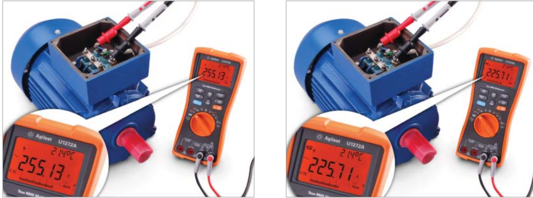
Figure 2. Comparison of voltage output from industrial motor VFD without and with Low Pass Filter functionality.

high frequency noise and harmonics. This ensures the efficiency of your motor filter as well.