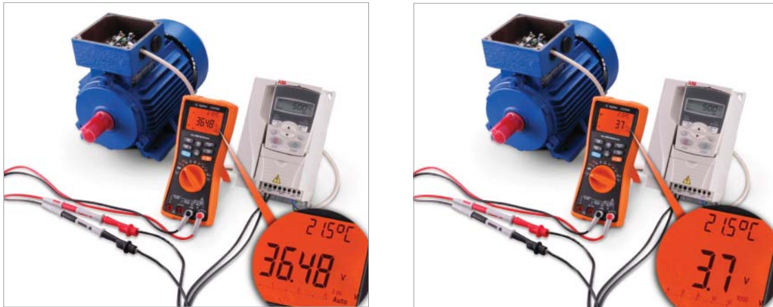
Figure 1. U1272A helps you identify the presence of stray voltage on a disconnected wire running parallel with the wire powering up the VFD to an industrial motor. The image on the right shows the U1272A in low impedance mode.

High input impedance multimeter is sensitive enough to measure voltage coupled into the disconnected conductor, thus giving an inaccurate indication of a live conductor. The low impedance function serves to eliminate false readings by dissipating the stray voltages, thus improving safety and measurement efficiency during voltage.