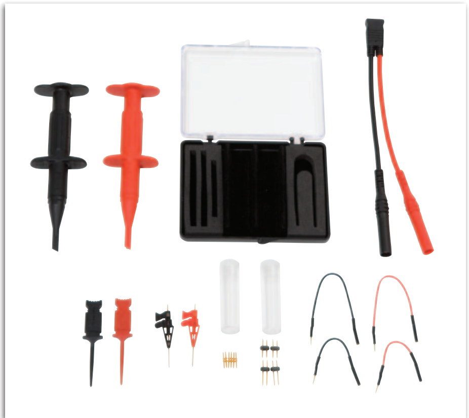
The ZD200 Accessory kit includes an assortment of leads, clips, and straight tips.