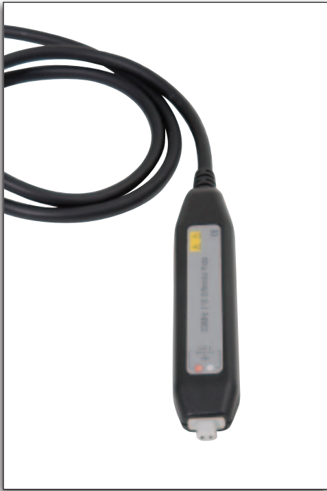
The ZD200 provides 2 closely spaced differential inputs to connect directly to header pins, or connect probe tips or leads.