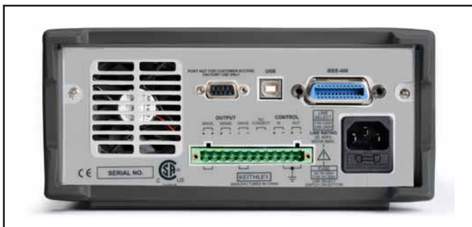
Series 2200 rear panel.

1.888.KEITHLEY (U.S. only) www.keithley.com