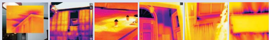
Water Damage — Water leak on ceiling, gutter, and roof top