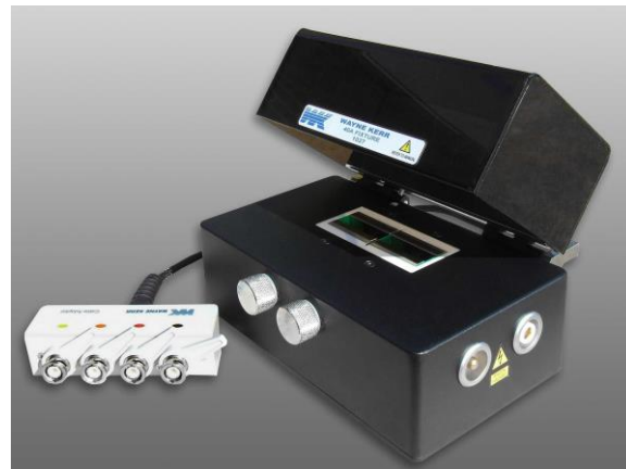
1027 Fixture (40 A)