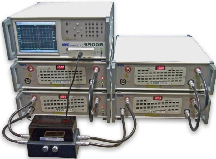
6500 Analyzer with four 6565's and 1027