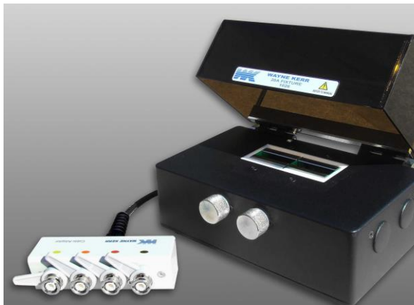
1026 Fixture (20 A)

For use with DC Bias Fixtures 1026 1027 and 1031